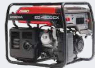
Wheel kit: 06710Z22A30