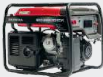
Wheel kit: 06710Z22A30