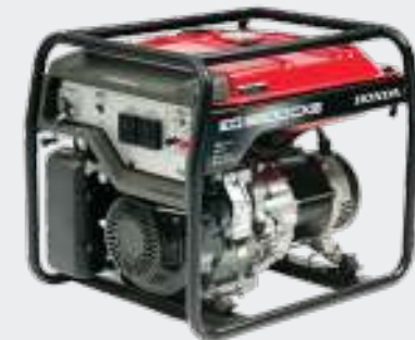
Wheel kit: 06710Z22A30