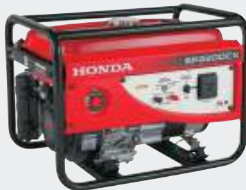
Wheel kit: 06710Z22A30